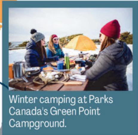
Winter camping at Parks Canada's Green Point Campground.